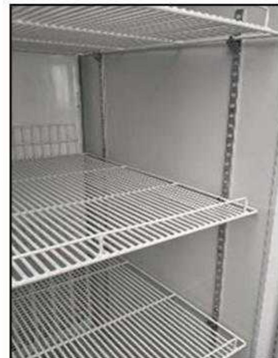
Adjustable wire shelves