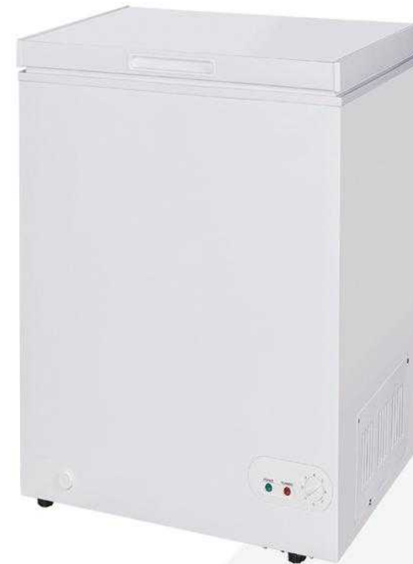
BD105C * 55mm thickness