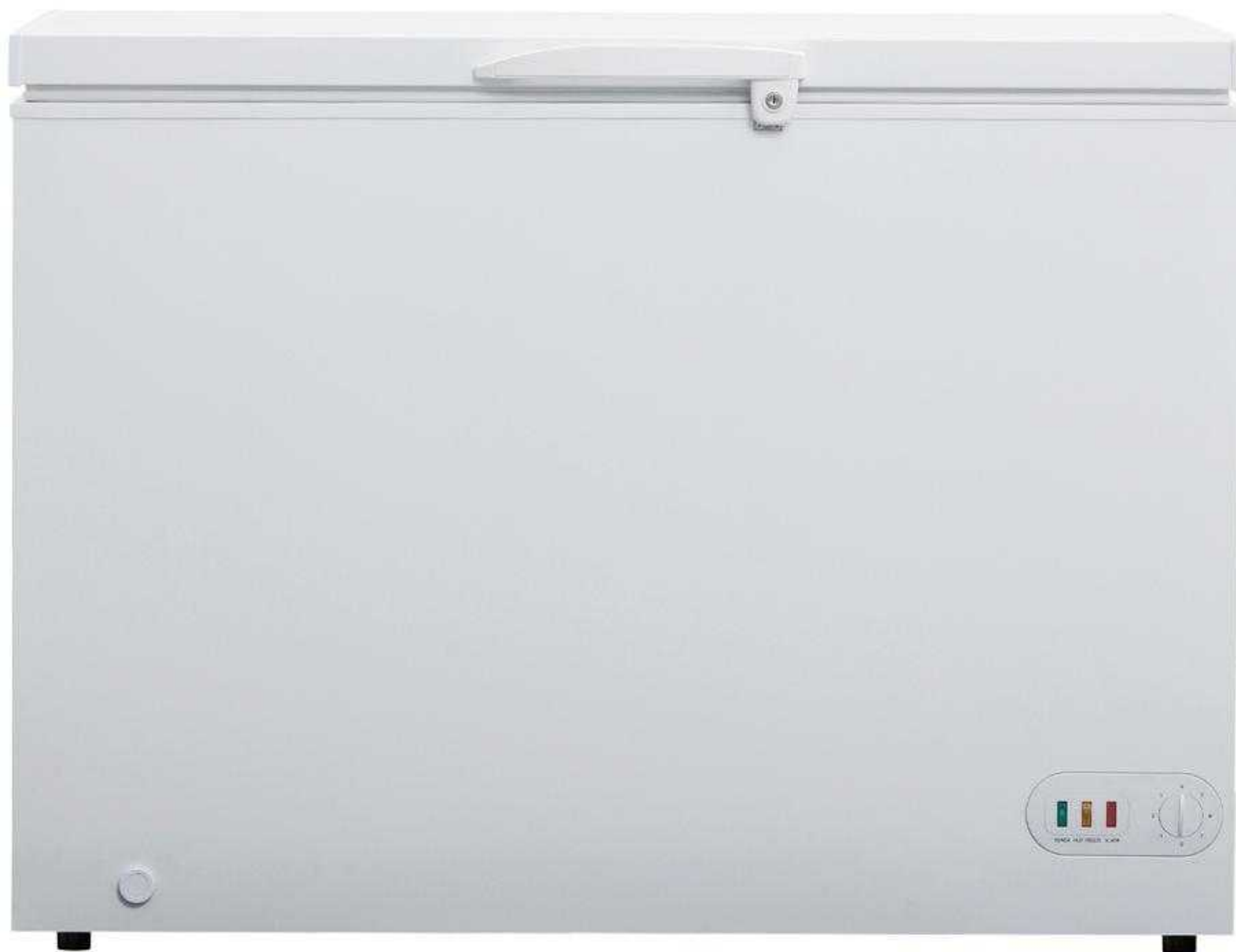
BD305/330/350/450/550/650 * 70mm thickness for BD350 & up