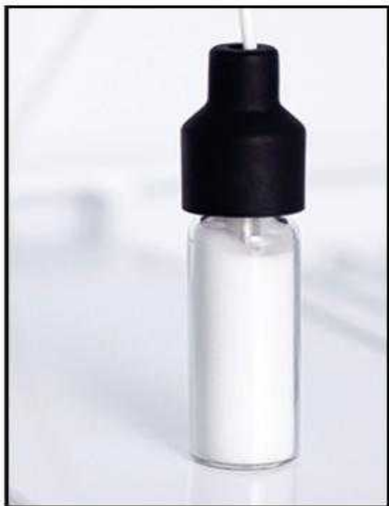
Buffer probe more accurate on temperature display